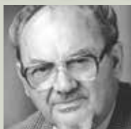
ANKER JØRGENSEN (1972-1973, 1975-1982)

ANKER JØRGENSEN , prime minister (1972-1973, 1975-1982) further developed the welfare society. Voluntary early retirement and nine years of mandatory schooling were introduced.