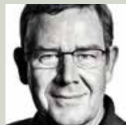
POUL NYRUP RASMUSSEN (1993-2001)

THE EUROPEAN UNION TREATY is ratified after alterations have been made including the four Danish op-outs and a second referendum in Denmark was held.