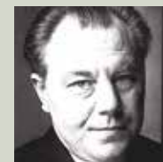
HANS HEDTOFT (1947-1950, 1953-1955)

World War II ends HANS HEDTOFT prime minister (1947-1950 and 1953-1955). During his time in office Denmark joined NATO. In 1953 he became the first president of the Nordic Council.