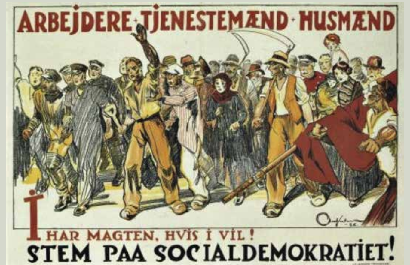
Social Democratic election poster from 1926 portraying workers, servants and smallholders demonstrating. A man to the right is carrying the Social Democratic flag.